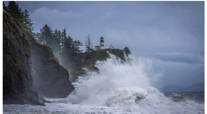
Photo from unknown source – taken during king tide on Washington Coast five years ago.