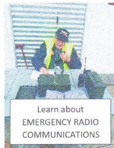
Learn about EMERGENCY RADIO COMMUNICATIONS