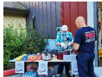
And Lee offered them up! It was a busy evening!!!